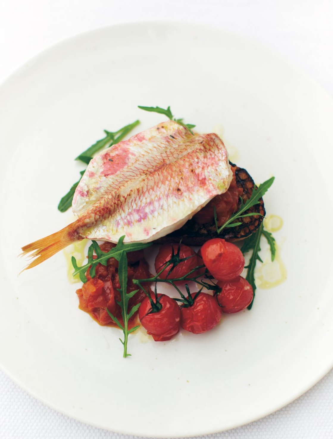
Taken from Nathan Outlaw's Fish Kitchen (Quadrille)